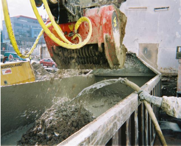
Plate 3 – Mixing of clayey soils with E-clay® slurry using the specialist processing bucket attachment on a conventional excavator.

The mixing was undertaken with a specialist bucket attachment that was used to screen out coarse material and then mix the soils.