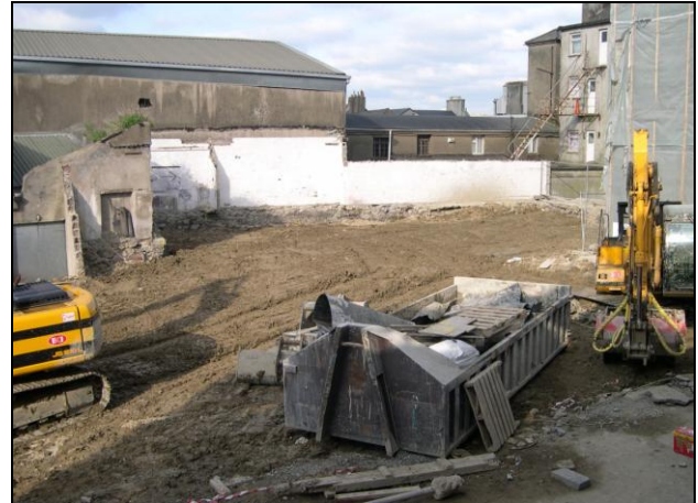
Plate 4 – Treated soils re-deposited ready for the construction phase to begin.

Table 2 presents the Maximum Contaminant Level (MCL) of TPH contamination present at the Waterford site prior to remediation and the results of leachate analysis post-treatment. The Site Specific Target Level (SSTL) has been adopted from a Groundwater Risk Assessment conducted by White Young Green, this value is also equivalent to the Dutch Intervention Standards for TPH in groundwater.