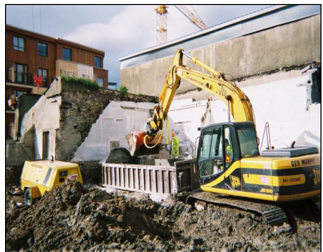
Plate 2 – Remediation of site using 'allu' bucket.

The works were conducted over a 2 week period under the auspices of Enviro-treat's Mobile Process Licence (MPL). Specialist technology, materials and supervision were supplied by Enviro-treat, whilst FLI Environmental supplied all the required plant, and labour for application of the Enviro-treat® Process.