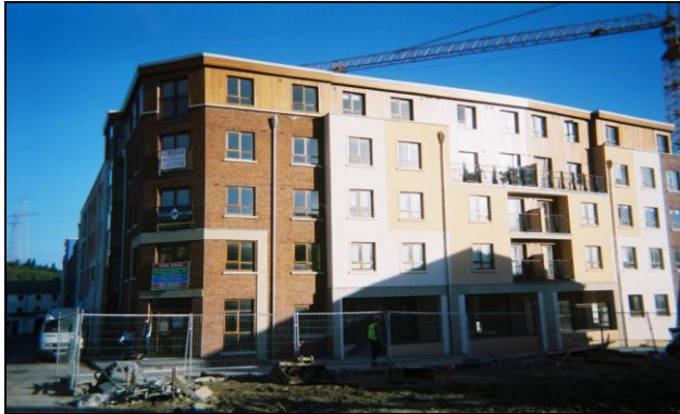
Plate 1 – Completed David Flynn residential apartment block on adjacent site.