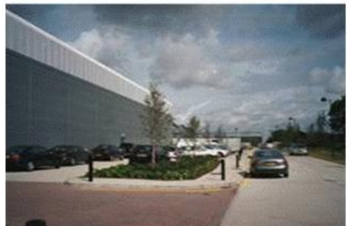
Plate 3 - Completed commercial development

The development was completed with the construction of a 200,000 sq ft of industrial and space (plate 3).