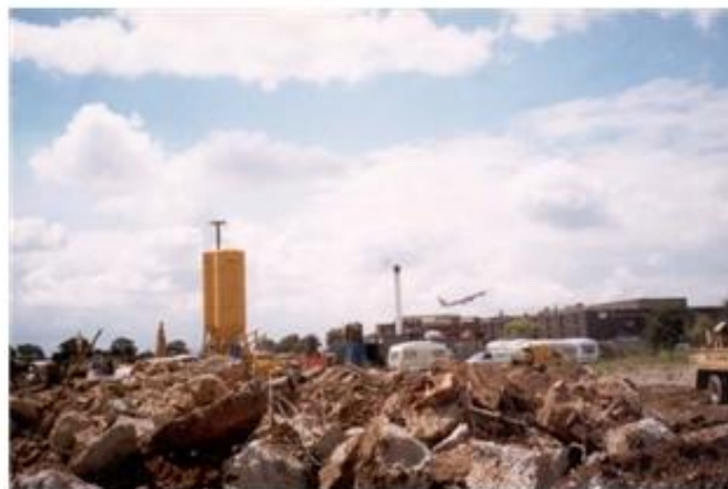
Plate 2 - The site prior to remediation

The remediation strategy at the Harmondsworth site was designed to address the on-site contamination problems and prevented the potential risk of future contamination of the adjacent site through groundwater migration.