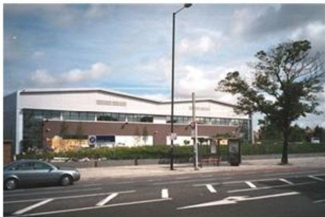
Plate 1 - Completed commercial buildings following the installation of the barrier.