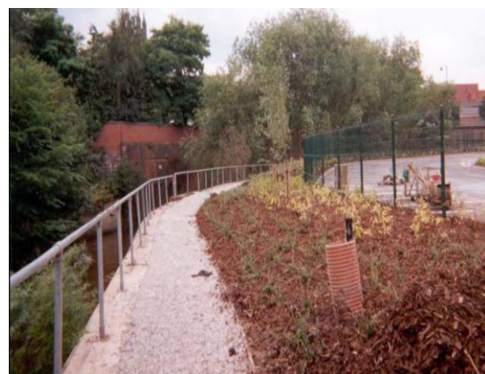
Plate 3 SMRBS along the river wall, landscaped following site development

The results demonstrated that the quality of groundwater had improved within the corridor of made ground between the barrier and the river. All of the contaminants of concern had been consistently removed from groundwater to below the identified target levels, illustrating the efficiency of the barrier system.