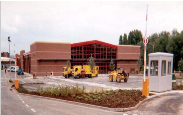
Plate 1- Millgate Gas Works fully developed for retail outlet.