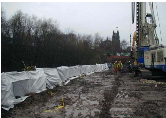
Plate 2 Installation of soil mixed columns using a continuous flight auger

A purpose designed E-clay ® treatment slurry was produced using batching plant facilities and injected under pressure down the hollow stem of the CFA. The E-clay ® slurry and passive materials were mixed in situ with the ground material to form soil mixed columns of treated material (Plate 2).