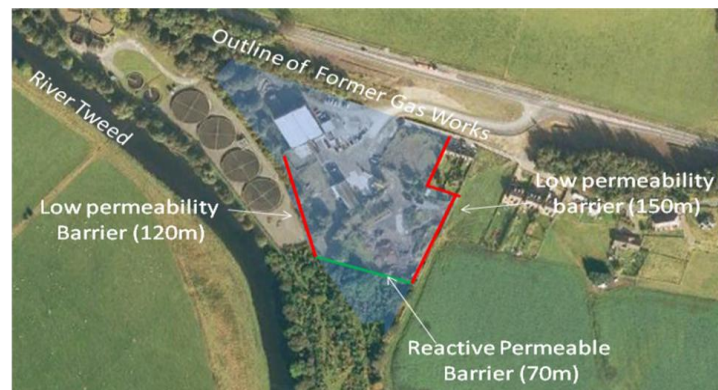
Plate 5 – The Installed Soil Mixed Barrier System for the Eshiels Project

The installed barrier system is shown in Plate 5 below.