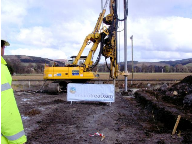
Plate 4 - Barrier Installation utilising a Carillion Piling CFA Rig and Expertise