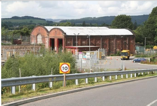
Plate 1 – Post Remediation

At the time of the investigation, groundwater was encountered between 0.6 - 8.0m bgl. The direction of groundwater flow was in an easterly direction and most likely impacting the River Tweed to the south east.