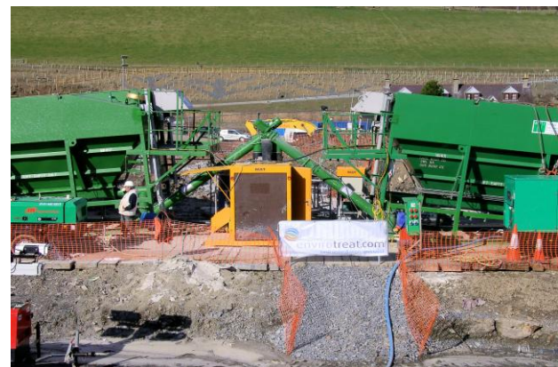
Plate 3 – Fully Automated Batching Plant

The two low permeability barrier walls were constructed using a total of 240 overlapping soil mixed columns, installed in a single row to a depth of 10 metres below ground level. The permeable reactive section was constructed using a total of 160 overlapping soil mixed columns, installed in a double row to the same depth (the double row columns interlocked in both directions). The inner row of columns contained proprietary E-Clay slurry designed specifically for treating the known presence of ammonia(ium). The outer row of columns contained proprietary E-Clay slurry designed specifically for treating the other contaminants of concern. The slurry batching facility and CFA barrier installation are shown in Plates 3 and 4 respectively