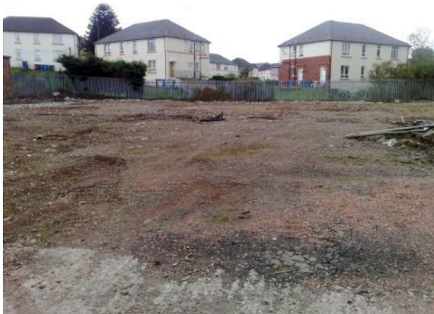
Figure 1 - Site Prior to Remediation