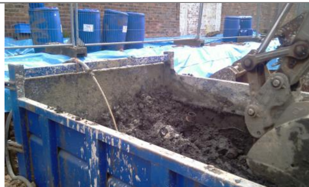
Figure 3 – Mixing contaminated soils with treatment reagents.

The remediation works were undertaken and completed within the agreed timeframe of six weeks.