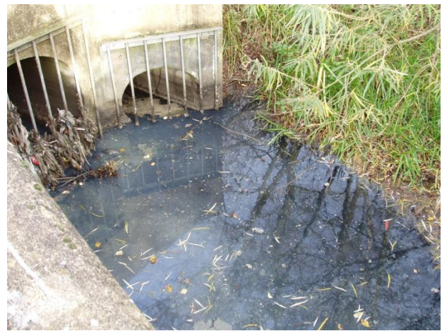
Plate 2 – General water contamination at the Sixfields site.

Removal of the source was quickly dismissed, the size of the site precluded a complete circling with an impermeable groundwater barrier and that it would unacceptably affect the overall groundwater regime of the area.