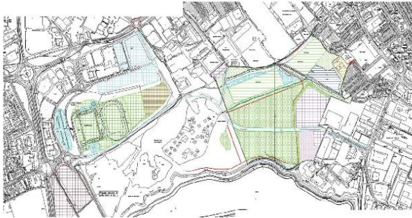
Plate 1 – Sixfields and Harvey Reeves Road Sites.