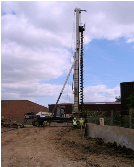
Plate 3 – Typical piling rig used at the Sixfields site.

A total of 3300 piles were installed over a length of 1500m, incorporating 34,500 linear metres of columns. The active and passive sections of the barrier were installed using a system on contiguous piles formed by soil mixing process using flight auger rigs. The passive section consisted on single line of contiguous piles and the active section by the installation of a double line of contiguous piles, necessary to achieve sufficient thickness of E-Clay material. The depth of the barrier ranged from 6m to 14m, the toe-in-depth of the barrier had to be sufficient to ensure any leachate from the landfill did not flow under the barrier, this was achieved by keying at least 1m into either the Upper Lias Clay deposits or Glacial Lacustrine deposits as necessary.