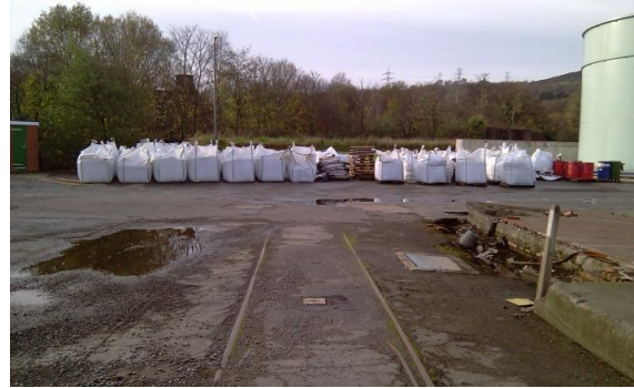
Figure 2 – Stored Bobby Waste

After prolonged use the filter media becomes coated in nickel deposited on the surface and as a consequence, the media becomes ineffective and requires replacement. The used filter media has traditionally been disposed of at a hazardous waste landfill in England at a distance from site exceeding 100 miles. This was considered to be unsustainable. Vale therefore undertook to identify a more sustainable and economically viable alternative to offsite disposal. The Bobby Waste is shown in Figure 3.