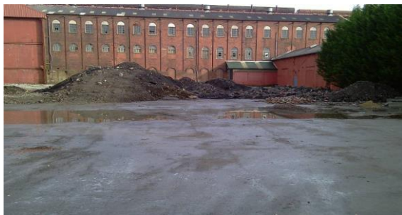
Figure 4 – Soil Arisings

It was decided that the treated material should remain on site due to impending changes with Landfill Tax which could have resulted in the treated material being taxed at £64/tonne and the stated requirement for fill material on site.