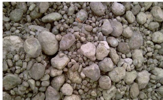
Figure 3 – Waste Stream (Bobby Waste)

Envirotreant demonstrated through treatability trials that the Bobby Waste could be treated to produce an inert waste, enabling cost effective disposal at a local landfill.